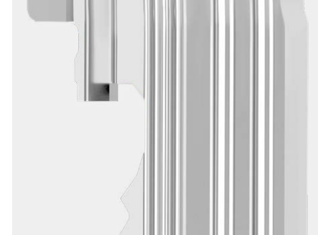
The Vitess locking system features the patented Intop system in both the cylinder and the key to provide effective protection against illegal key copies and manipulation of the lock cylinder.