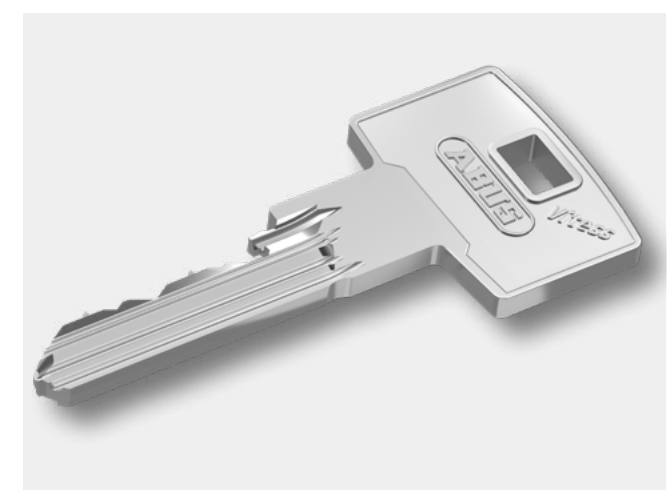
The high-quality, stable key is made from low-wear nickel silver to ensure long-term security. The unique shape makes the key extraordinarily stable.