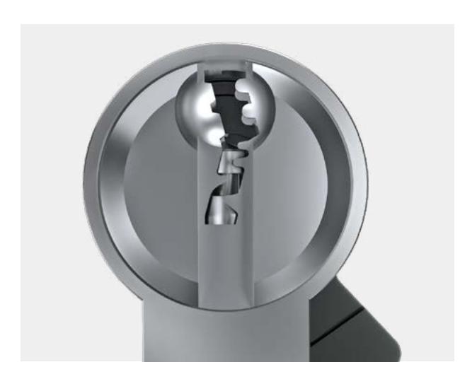
The curved profile provides protection against intelligent opening methods.